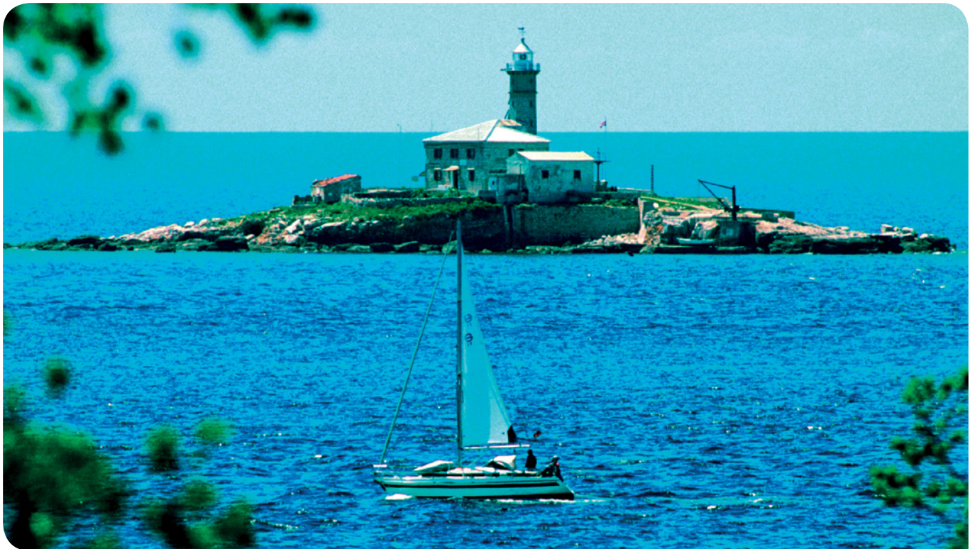
Sv. Ivan Lighthouse

Near the island of St. John at Sea there is a large reef where a lighthouse was built (22 m high) in 1853, one of many constructed in the second half of the 19 th century by the Austrian Empire for safer navigation along the eastern Adriatic coast.