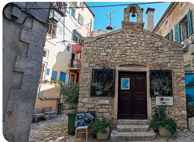
St. Benedict's Square and Church

As remembered by old Rovinj inhabitants, Archduke Karl Stephan Habsburg, the admiral of the Austrian fleet (who owned the St. Katarina island from 1899 to 1904; please see IV/1 ), used to come to Rovinj in the evenings and spend time in one of the spacios in Ulica Pod Lukovima (near St. Benedict's Square) enjoying Malvasia and Teran wines and relaxing to the sounds of traditional Rovinj songs, especially bitinàdas .