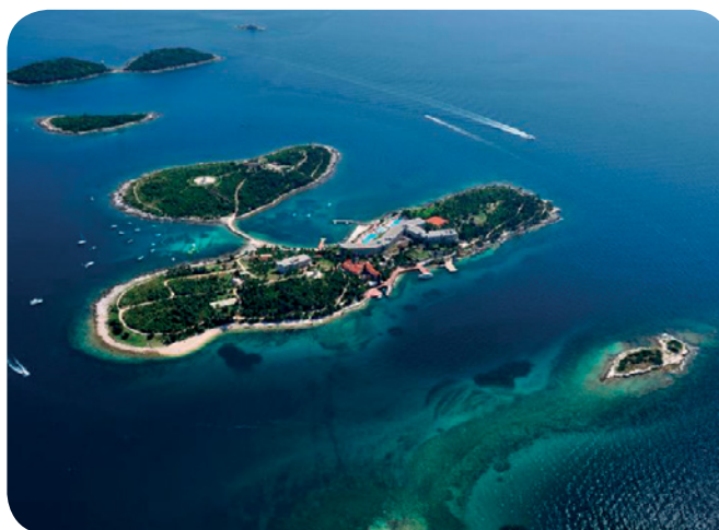
St. Andrew's Island