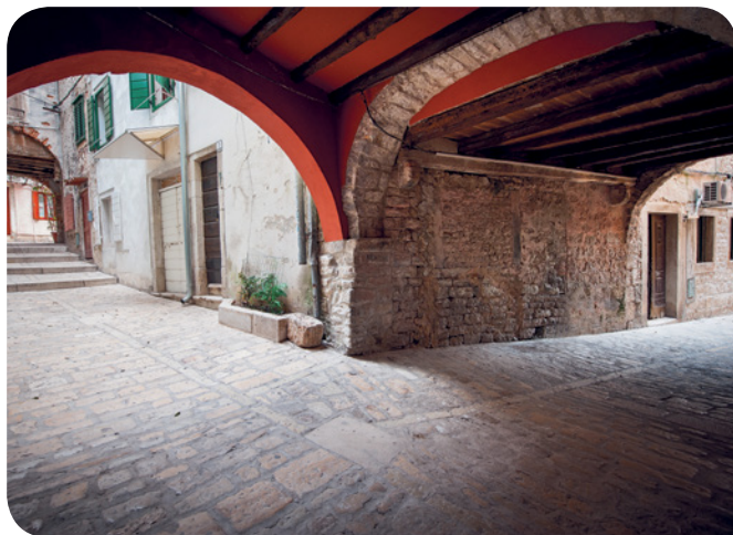
Under the Arches Street