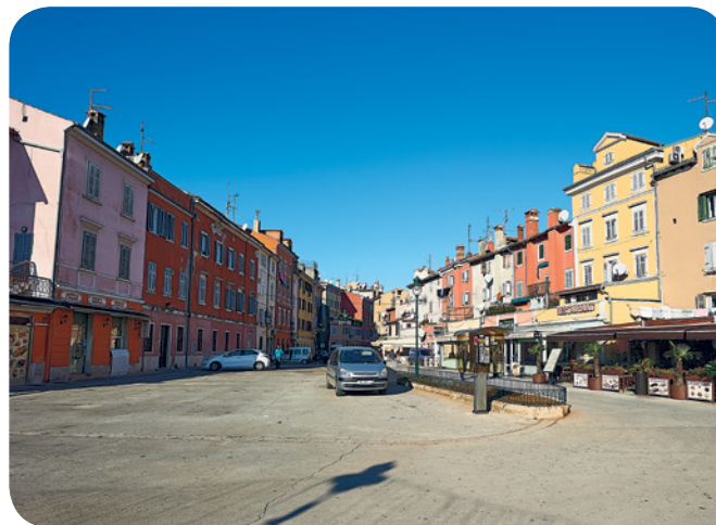
Giovanni Pignaton Square

This small medieval church was built in 1364 at the behest of Rovinj sailors. A new and larger church was constructed in 1860 on its location, when a new wooden altar with the statue of St. Nicholas of Bari was erected as well, as witnessed by the inscription on the church's front: D.O.M.// S.NICOLAO EPISCOPO // PIIS LARGITIONIBUS // E FUNDAMENTIS // READIFICATA // ANO R.S. // MDCCCLX OCT. The church is nowadays used as an atelier, and services are not held there.