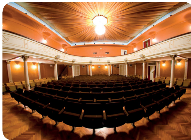
"Antonio Gandusio" Theater