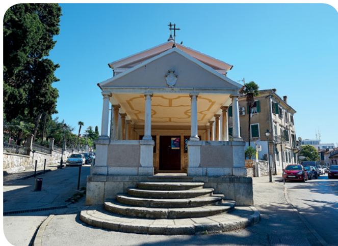
Church of Our Lady of Mercy