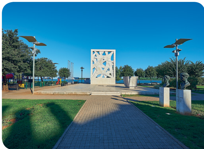
Monument to the fallen anti-fascist partisan soldiers