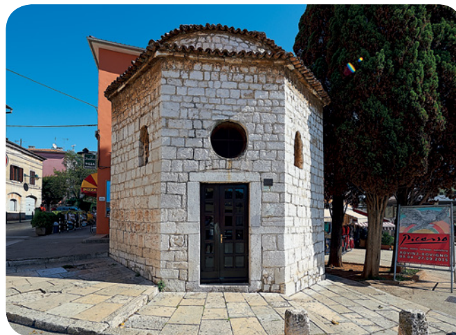
Church of Holy Trinity

The square owes its name to a large pond which existed on this location until the second half of the 19 th century and was primarily used to water cattle. During the French rule, authorities attempted to transform the pond into a large cistern thus erecting stone walls around it. In 1862, the part of the pond facing Carera Street was filled in, while the rest of the pond was filled in twenty years later.