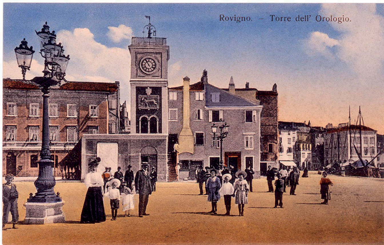
Rovinj's square in the past