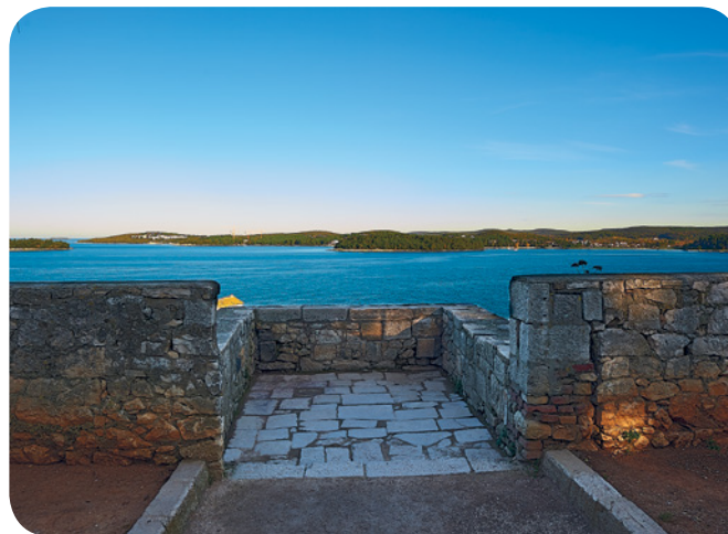
Belvedere over Dreïocastiel and Valdibora Bay

The nearby medieval church of St. Thomas was also reconstructed during that period, which later spread over the vaulted street area between the church and the Field on the Hill. Even today the church is entered from the upper level via an external staircase. It is not used for liturgy, but as a venue for Rovinj Art Programme / RAP / organised by the Rovinj Heritage Museum.