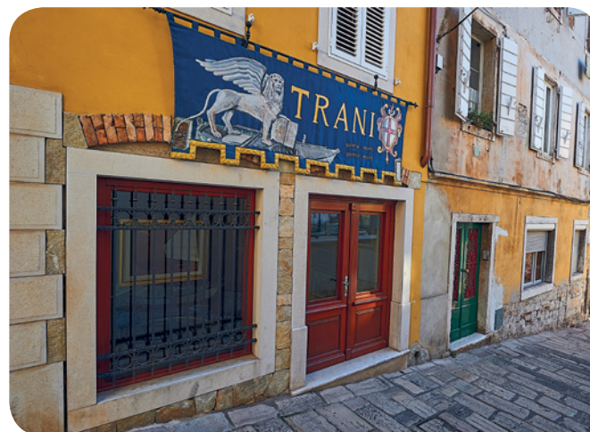
Ethnographical Collection and Workshop Trani

The church was built in 1668 in the middle of Carera and was dedicated to Milanese Cardinal St. Charles Borromeo (16 th century). There are several tombs in the church's floor. There has been no service for years, the church is instead used as an atelier.