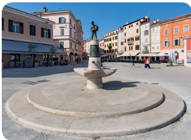
Marshal Tito Square