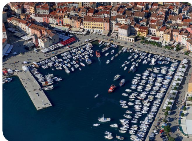
Aldo Negri Coast and Aldo Rismondo Coast