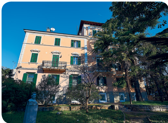
Villa Maria Antonia