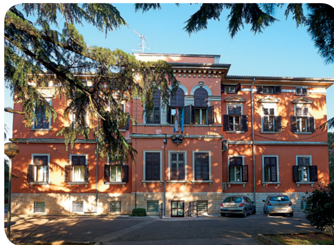
Building of the Home for Adults "Domenico Pergolis"

The Branch of Matica Hrvatska in Rovinj and the Croatian Cultural Society "Franjo Glavinić" - The Croatian Cultural Society 'Franjo Glavinić', founded on 24 November 1990, has had its headquarters in this building from early 1990s. Since its establishment, the Society has organised many lectures, cultural and literary evenings, book and journal presentations, honouring the work of many clubs, especially choir, recital and folk clubs as well as book workshops.