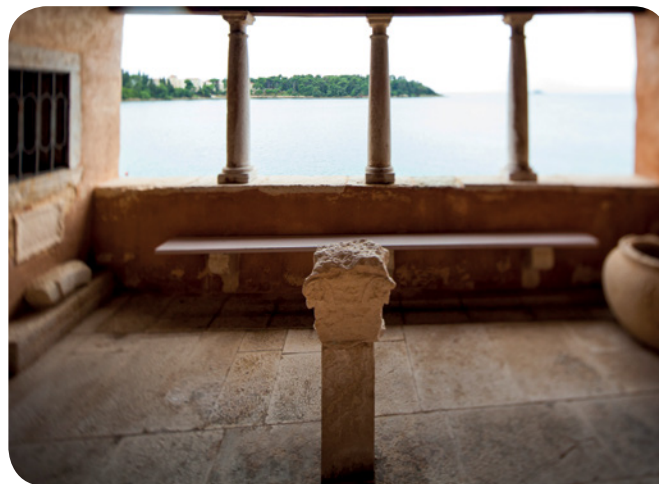
St. Cross Church