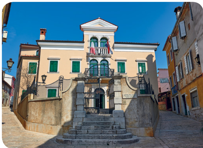
The Italian Community 'Pino Budicin' – Fabris-Milossa Palace