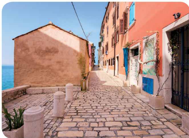
St. Cross Street