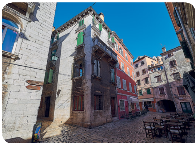
Veli trg (Piassa Granda)