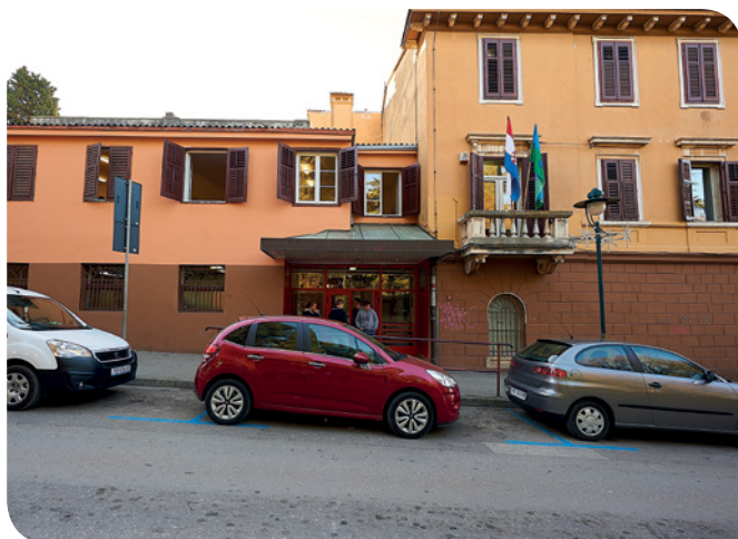
Eugen Kumičić Vocational School