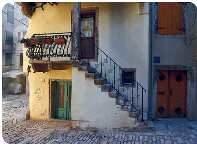
Baladur Sa Pavane