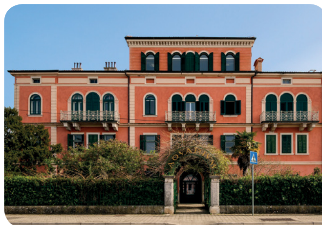
Centre for Marine Research of the Ruđer Bošković Institute

The scientific library of the Centre is located in the former medieval St. Gotard's Church.