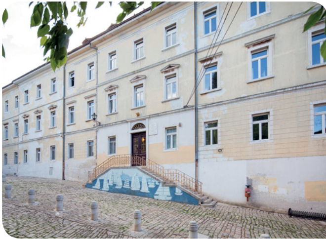
Vladimir Nazor Elementary School