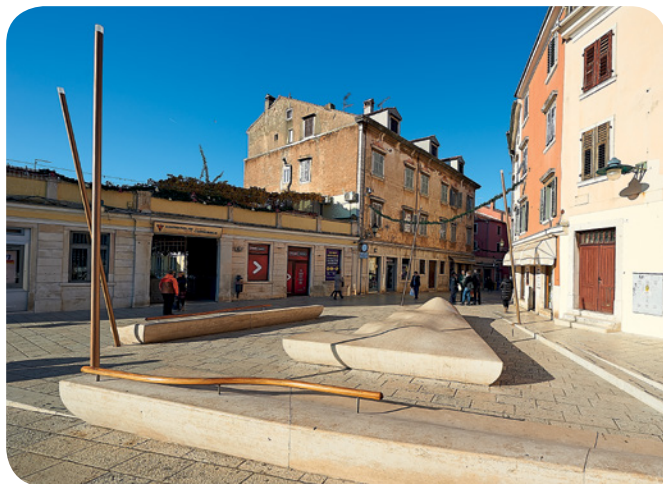
Trg na lokvi