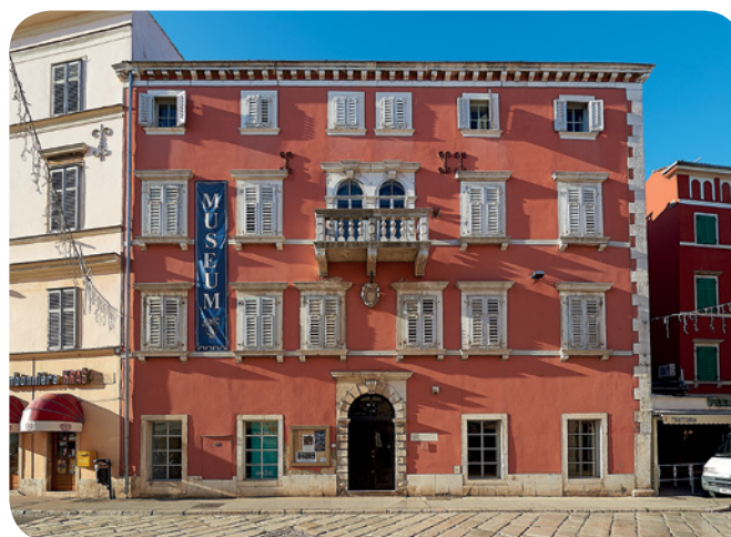
Rovinj Heritage Museum

The name plate on the building housing the 'Al Ponto' coffee shop is dedicated to local Pietro Ive (1889 - 1921), one of the first victims of the fascist terror in Istria.