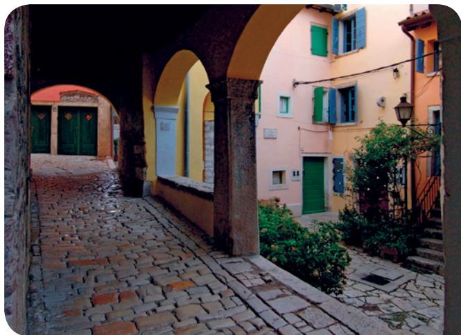
Field on the Hill