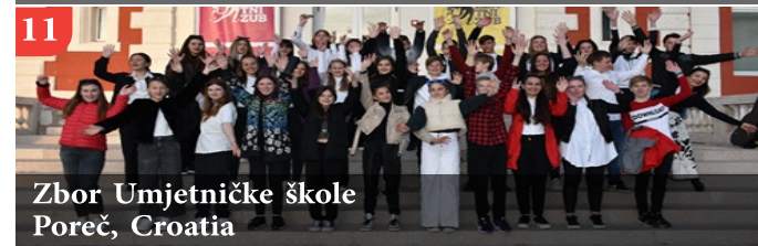
11 Zbor Umjetničke škole Poreč, Croatia