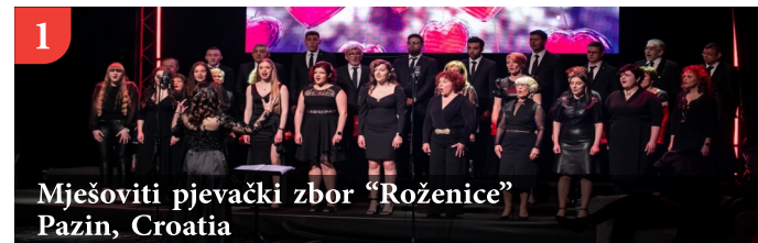
1 Mješoviti pjevački zbor "Roženice" Pazin, Croatia