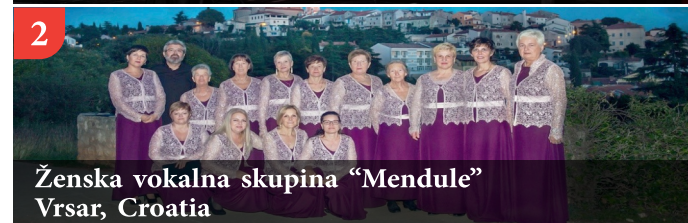
2 Ženska vokalna skupina "Mendule" Vrsar, Croatia

2 The female choir "Mendule" from Vrsar was founded in 1996. "Mendule" especially promote the musical heritage from Istria and Primorje-Dalmatia regions, as well as the works of classical music and entertaining Croatian and worldwide music. They regularly perform at cultural and tourist manifestations, where there are often included as organizers of various cultural events in Vrsar. „Mendule“ have been performing throughout Croatia and most of the European countries, proudly promoting the tradition and customs of their region.