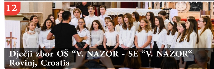
12 Dječji zbor OŠ "V. NAZOR - SE" Rovinj, Croatia