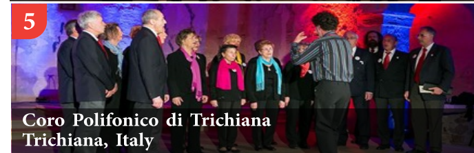
5 Coro Polifonico di Trichiana Trichiana, Italy