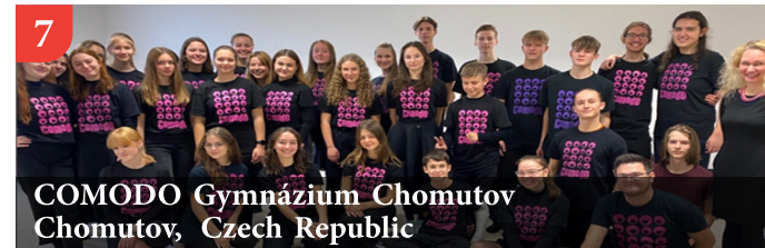
7 COMODO Gymnázium Chomutov Chomutov, Czech Republic