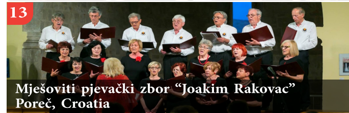
13 Mješoviti pjevački zbor "Joakim Rakovac" Poreč, Croatia