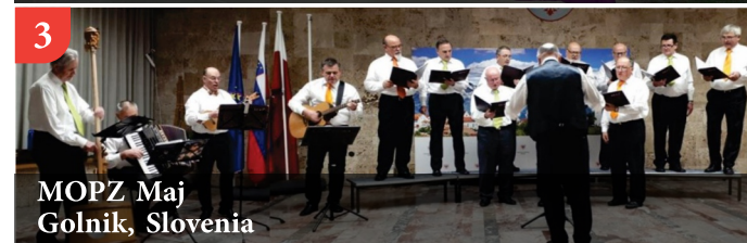
3 MOPZ Maj Golnik, Slovenia

3 The men's choir "MAJ" from Kranj performs choral and popular music by Slovenian and foreign authors at their performances in their own country and abroad. Parts of their performances are enriched with instrumental accompaniment of their own instrumental group and adaptations of popular and own compositions. The Choir has been rejoicing its public with beautiful and carefully selected repertoire for more than 26 years. They enjoy inviting other singing and music groups to its annual concerts organized in May and December in Kranj as well as take part at other festivals in Slovenia and abroad. The fifth season is led by the conductor Mr. Andrej Zupan.