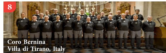
8 Coro Bernina Villa di Tirano, Italy