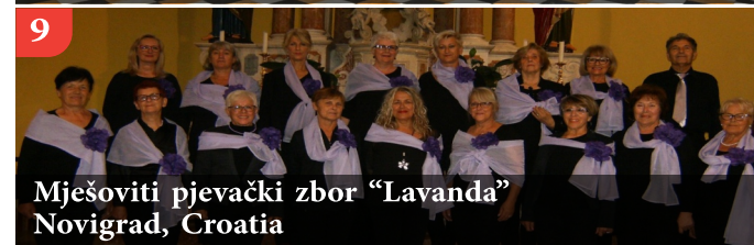
9 Mješoviti pjevački zbor "Lavanda" Novigrad, Croatia