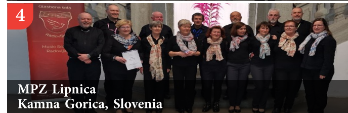
4 MPZ Lipnica Kamna Gorica, Slovenia