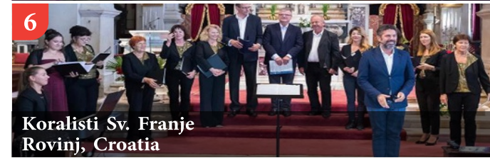
6 Koralisti Sv. Franje Rovinj, Croatia

6 Chamber ensemble "Koralisti Sv. Franje" continues the tradition of the famous Scale cantorum, which has operated in the St. Francis monastery since the 18th century by singing on the liturgical celebrations. The choir consists of singers of different age who share a love for singing, while the repertoire is composed of local and famous world composers.