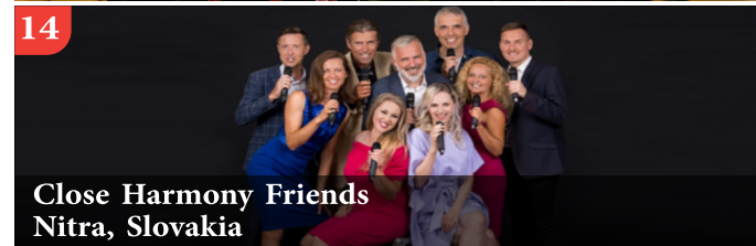
14 Close Harmony Friends Nitra, Slovakia