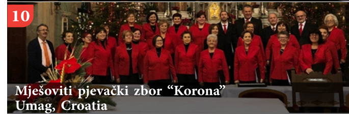
10 Mješoviti pjevački zbor "Korona" Umag, Croatia