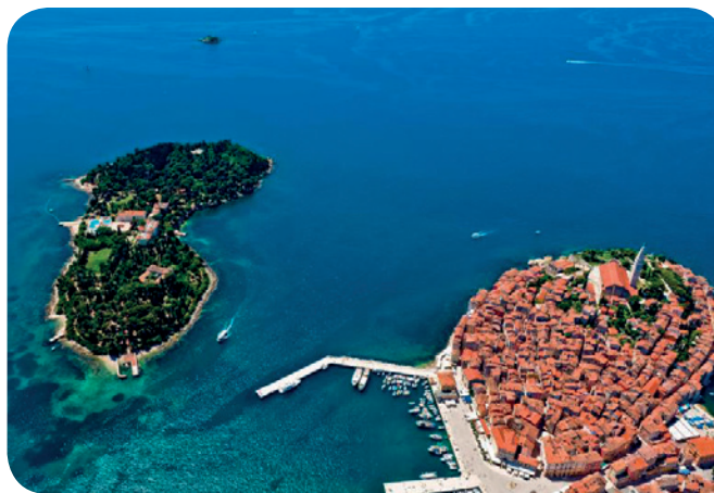
St. Catherine's Island

The island later became the property of the Rismondo family who sold it in 1898 to the Archduke Karl Stephan. The island was then sold in 1904 to Polish-Lithuanian Count Korvin Milevski who started the afforestation of the island. He also paved the paths with bricks and the stairways with stone, built four piers and a rainwater cistern, as well as a large and beautiful building in the very centre of the island. In order to dissuade the citizens of Rovinj from using the island beaches, he started to build the so-called 'new bathing area' in 1913 (also called the 'Roman' bathing place after the columns which were supposed to support the unfinished terrace), where the today's pool 'Delfin' is located. After his death in 1926, the island became the summer residence of the 'great Italian invalid' of the First World War – Carl Delacroix, while from 1937 to 1945 it was owned by Ernesto Selle from Bielle (Italy). The island became a tourist destination as early as the beginning of 1950s, and its beautiful nature and excellent hotel offers make it today one of the best tourist destinations in Rovinj.