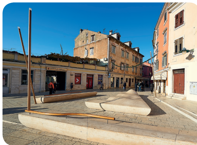
Trg na lokvi

Upon the proposal of the Italian Community 'Pino Budicin' in 2007, bitinada was included in the Registry of Cultural Goods of the Republic of Croatia as a 'vocal music style of the Italian national community and the cultural space of the town of Rovinj'.