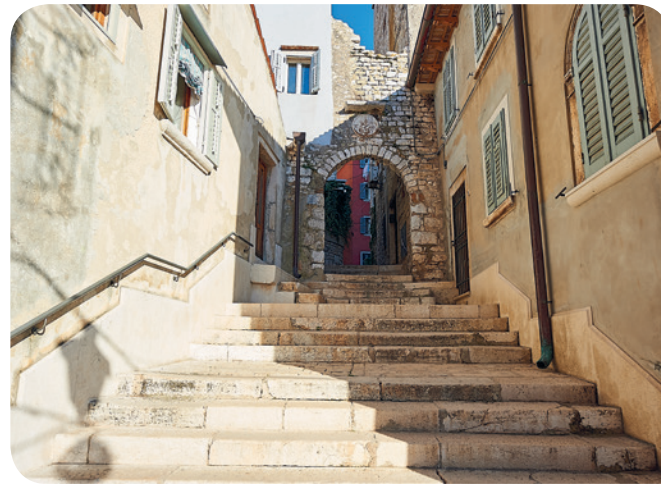
St. Cross Gate

The legend says that in the night of 13 July 800, a sarcophagus carrying the body of St. Euphemia floated from Constantinople into the small cutting in the sea rock under the church of St. Cross (please see I/A-17. The Church and Legend of St. Euphemia ). In 1720, a stone pillar was erected there which emblem and inscription (D.O.M./DIVAE EVPHEMIAE RUBINENSIVM//NUMINI TUTELARI AC TITOLARI//CIVITATIS OBSEQVENTISSIME VOTV ANNO 1720) reminds us that that year, while Zuanne Premarino was the town prefect, a decision on the construction of the new St. Euphemia church was adopted (please see I/A-17.).