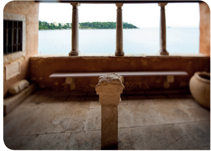
St. Cross Church