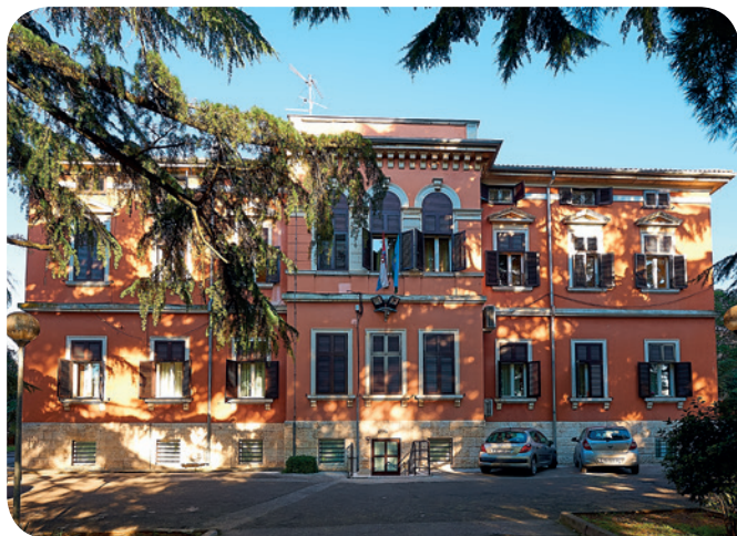
Building of the Home for Adults "Domenico Pergolis"