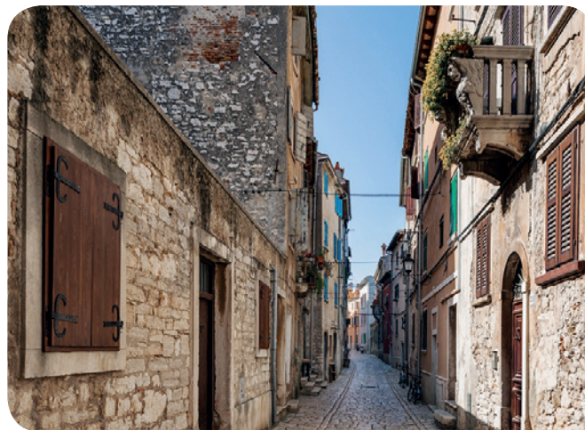
Vladimir Švalba Street

Next to the green market, there is a fish market renovated in 2004, with another entrance from Garibaldi Square. Until 1947, this was the seat of the Rovinj printing house opened in 1859 first as Prima tipografia istriana , then Tipografia Coana and finally the Town printing plant .