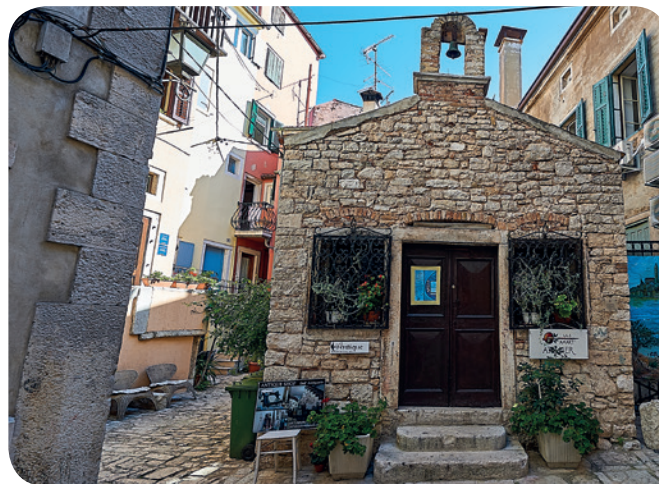
St. Benedict's Square and Church

As remembered by old Rovinj inhabitants, Archduke Karl Stephan Habsburg, the admiral of the Austrian fleet (who owned the St. Katarina island from 1899 to 1904; please see IV/1 ), used to come to Rovinj in the evenings and spend time in one of the spàcios in Ulica Pod Lukovima (near St. Benedict's Square) enjoying Malvasia and Teran wines and relaxing to the sounds of traditional Rovinj songs, especially bitinàdas .