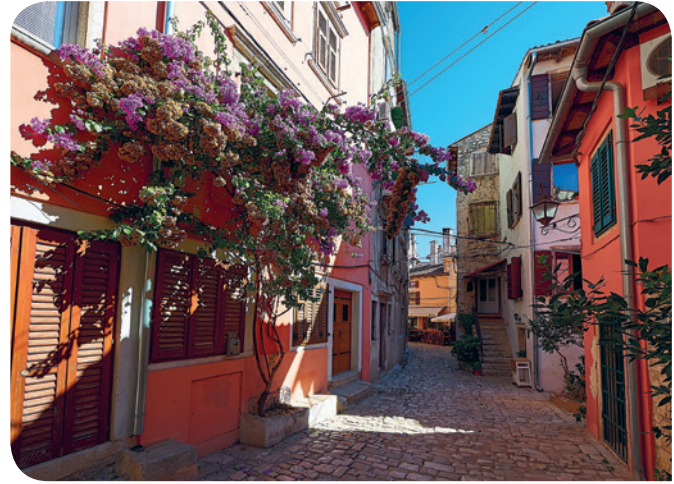
Trevisol Street and Pìan del Tibio Square