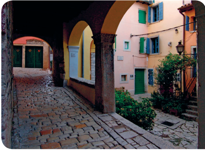
Field on the Hill