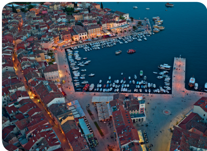
Aldo Rismondo Coast