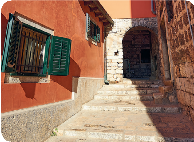
St. Benedict's Town Gate