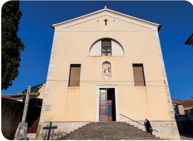
Monastery and Church of St. Francis