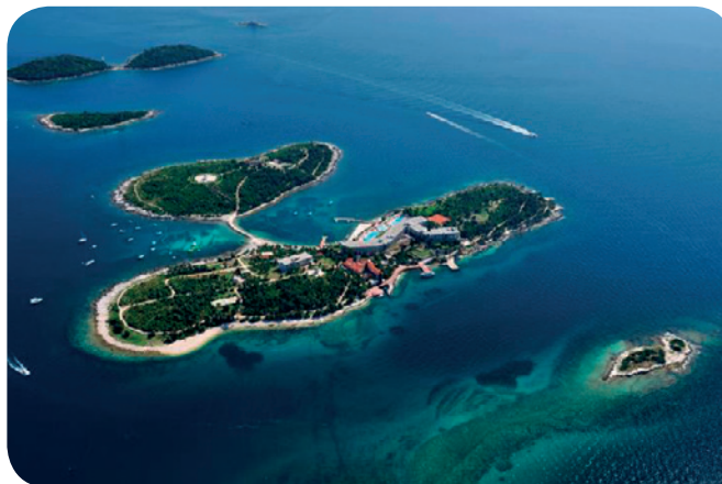
St. Andrew's Island