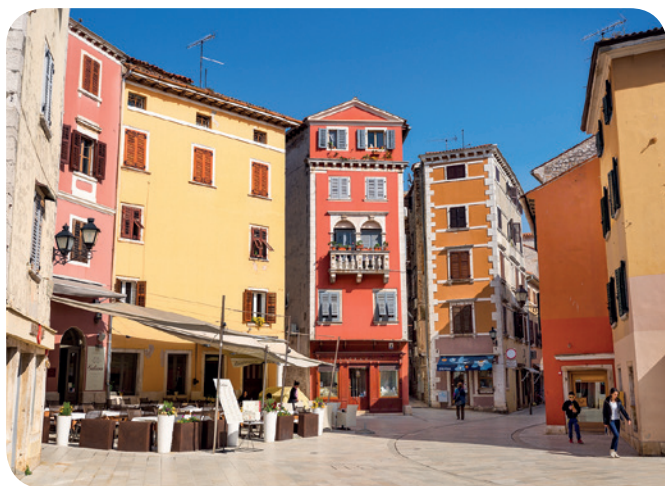
Square on the bridge