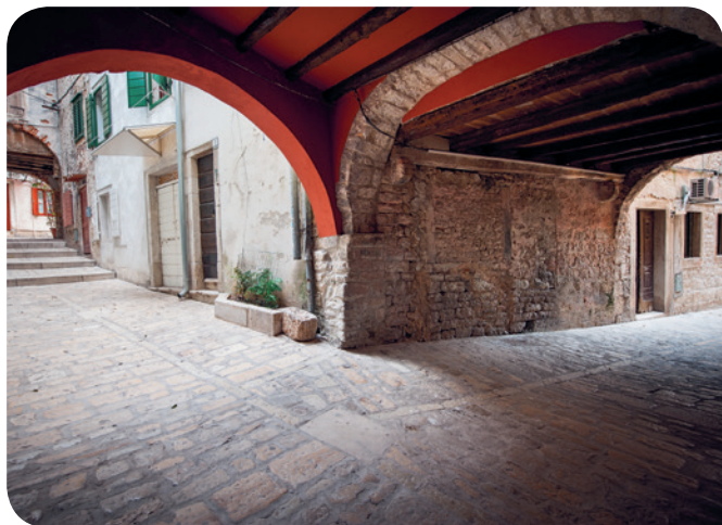
Under the Arches Street