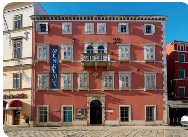
Rovinj-Rovigno City Museum

The name plate on the building housing the 'Al Ponto' coffee shop is dedicated to local Pietro Ive (1889 - 1921), one of the first victims of the fascist terror in Istria.