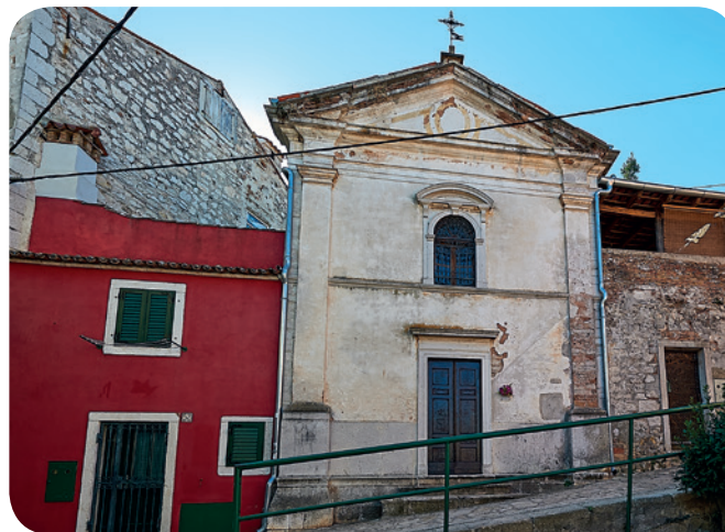
Church of the Blessed Virgin of Health

the typical Rovinj tavern, and since then, it has been a venue for wine and food tastings and musical evenings. This is the place which perfectly pairs Malvazija, Teran, olive oil, fish and seafood with the typical and distinctive melodies of Rovinj.