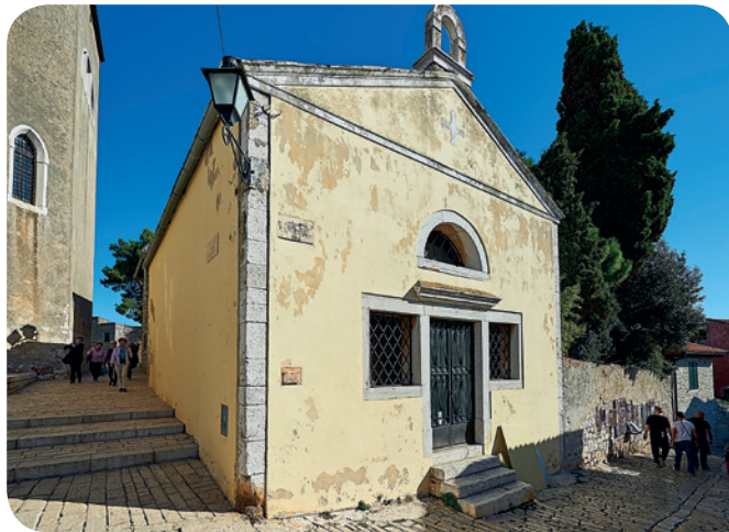
St. Joseph's Church