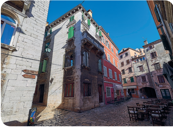
Veli trg (Piassa Granda)