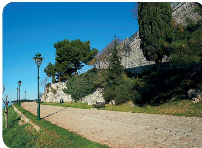
Gnot Brothers' Promenade

Near the Ascent, on the plateau below the walls of the old cemetery, in 1985, an old cannon was installed, cast in Pula, and containing an inscription dedicated to numerous Rovinj people (more than 2000 of them) who had been employed in the newly opened Arsenal/Shipyard in Pula from the mid-19 th century (nowadays, "Uljanik" shipyard).