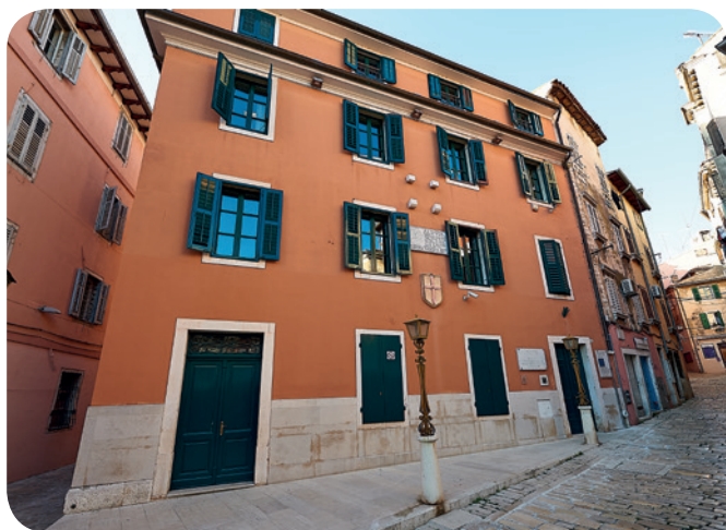
Centre for Historical Research