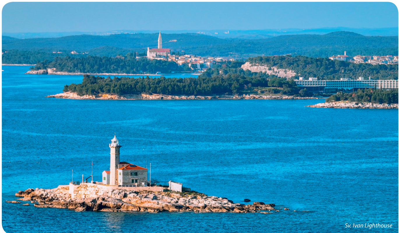
Sv. Ivan Lighthouse

Near the island of St. John at Sea there is a large reef where a lighthouse was built (22 m high) in 1853, one of many constructed in the second half of the 19 th century by the Austrian Empire for safer navigation along the eastern Adriatic coast.