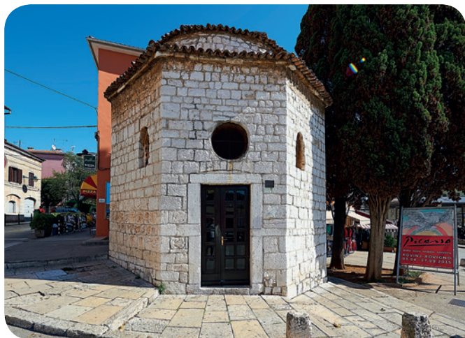
Church of Holy Trinity