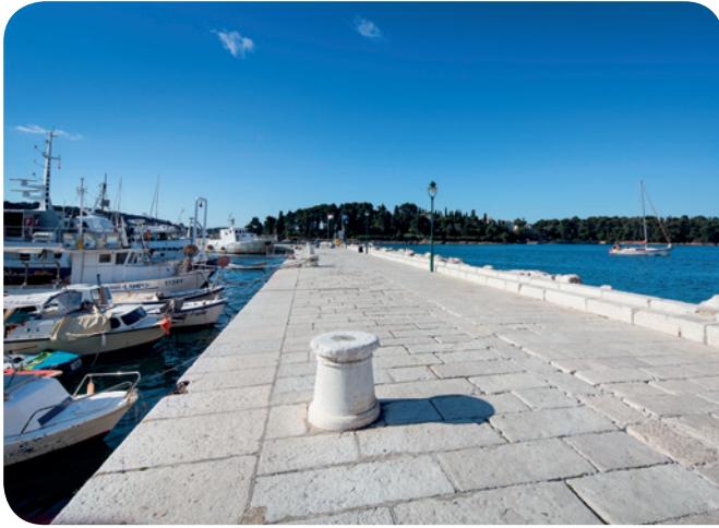
The Great Pier