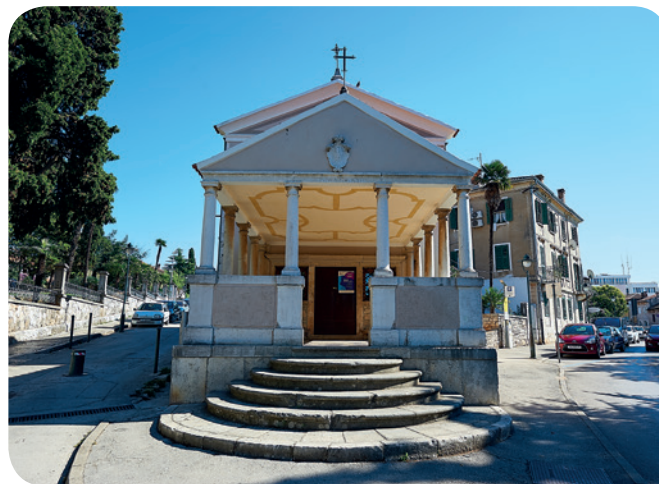
Church of Our Lady of Mercy

During the interwar period, the building was a home to the Giosuè Carducci Elementary School and the Armando Diaz Technical Institute. Immediately after the Second World War the Gymnasium with lectures in Italian was opened here as well. In 1954, classes in Croatian started. Today the building is a home to the Zvane Črnja High School as well as to the Italian High School. There are several Roman amphorae and inscriptions in its halls.