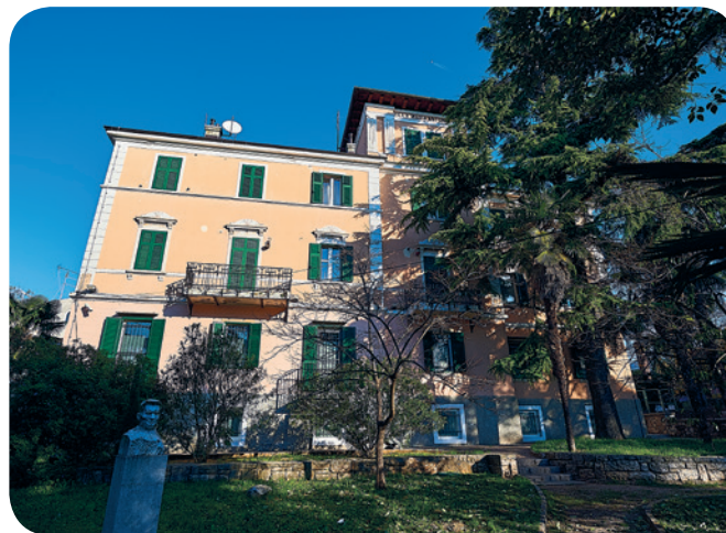
Villa Maria Antonia

The heptagonal Romanic church is one of the most significant monuments of Rovinj. The inner circular space has seven niches and a round dome covered by a conical roof. The beautifully conserved window transenna, depicting 'Golgota' with the figures of Madonna, St. Magdalene, St. Peter, John the Baptist, and John the Evangelist, is a true work of art. Service is not held in the church which has become a gallery.