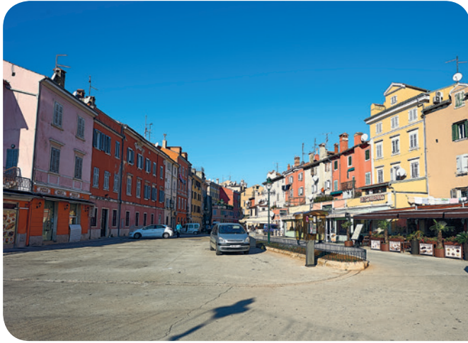
Giovanni Pignaton Square