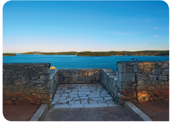
Belvedere over Dreïocastiel and Valdibora Bay

The nearby medieval church of St. Thomas was also reconstructed during that period, which later spread over the vaulted street area between the church and the Field on the Hill. Even today the church is entered from the upper level via an external staircase. It is not used for liturgy, but as a venue for Rovinj Art Programme / RAP / organised by the Rovinj Heritage Museum.