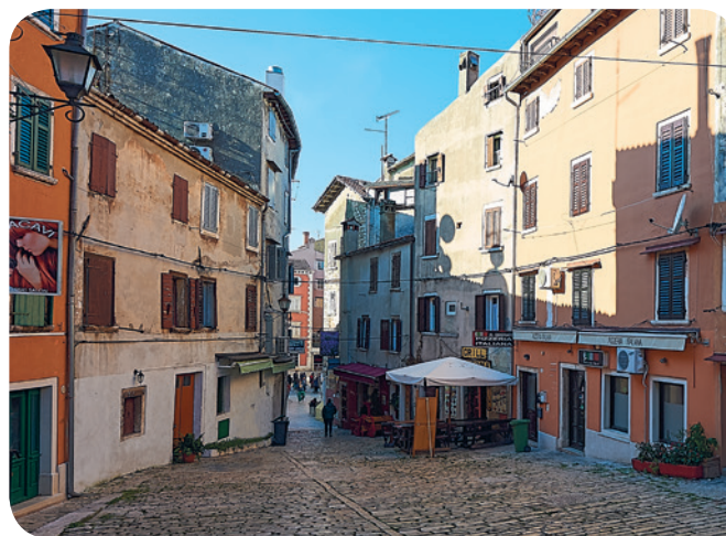
Edmondo De Amicis Street

The northern side of the square ( see I/A-3 ), in front of the 'Calisona' restaurant, has Baroque buildings arranged in a semicircle. The Lorenzetto family had constructed a small Church of St. Anthony of Padua in 1854 on this very spot, which marked the start of the urbanisation on the other side of the canal. By demolishing the church in 1933, the square became more spacious.