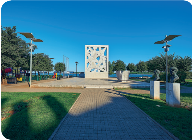
Monument to the fallen anti-fascist partisan soldiers