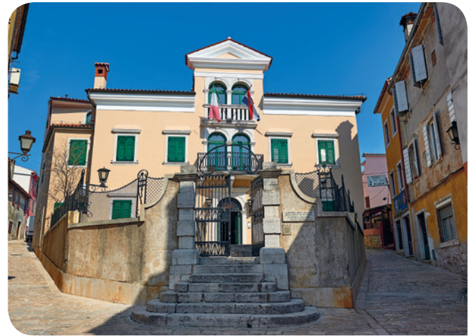
The Italian Community 'Pino Budicin' – Fabris-Milossa Palace

The church was built in 1668 in the middle of Carera and was dedicated to Milanese Cardinal St. Charles Borromeo (16 th century). There are several tombs in the church's floor. There has been no service for years, the church is instead used as an atelier.