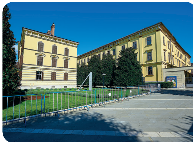
Building of the former Tobacco Factory

The houses along the most part of the Aldo Rismondo Coast were located on the very seafront until 1868, when the construction of today's boardwalk started. In 1911 and 1912, the boardwalk was extended to St. Nicholas' Cape.