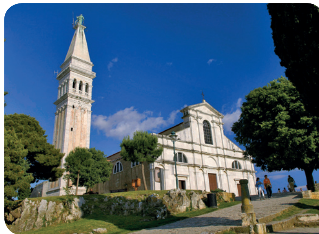
Church of St. Euphemia