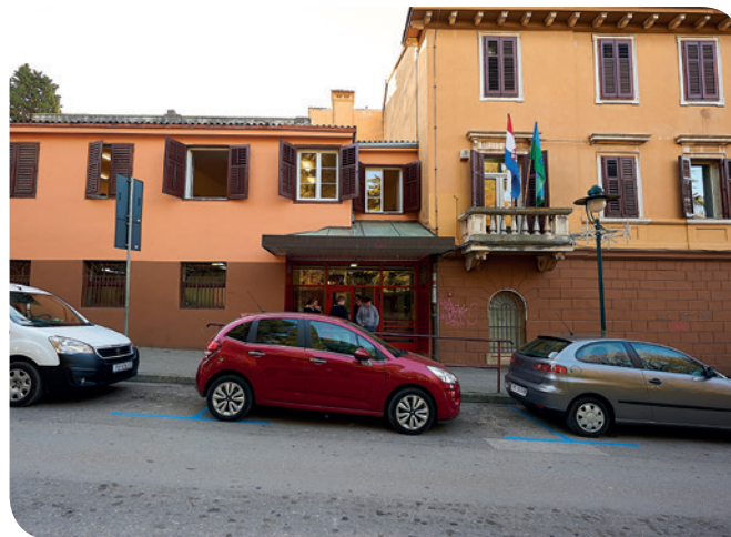
Eugen Kumičić Vocational School

The Rovinj Home for Adults is located in the building erected in 1900, together with the surrounding large and beautiful park, due to benefactor Domenico Pergolis (Rovinj, 1829-1901; see I/C-3) who had donated a significant amount of money to build the new home for the poor.