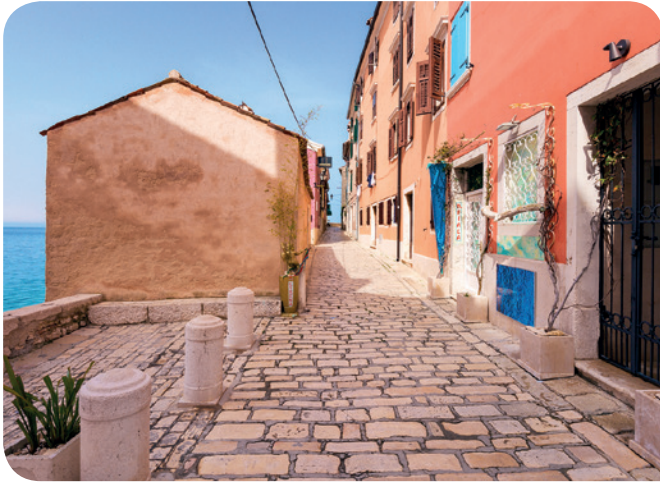
St. Cross Street