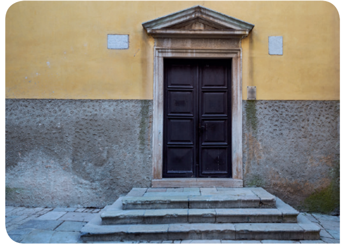
Small field of the Oratory of Our Lady of Sorrows

Walking down these streets will definitely leave a strong impression because it is a kind of a time machine. A small building (No. 1) with a high chimney at the very beginning of Silvano Chiurco Street once housed one of the numerous Rovinj bakeries which spread the divine smell of freshly baked bread and rolls. Until the 19 th century, at the intersection in front of that building, there was a spring of fresh water after which a nearby street was named: Zdenac (The Well).