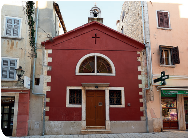
Church of St. Charles Borromeo