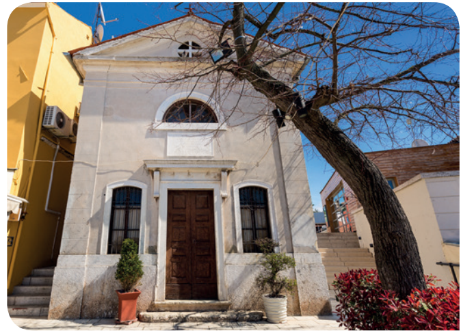
St. Nicholas' Church