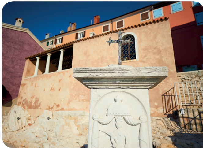
Cutting and the St. Euphemia's Pillar