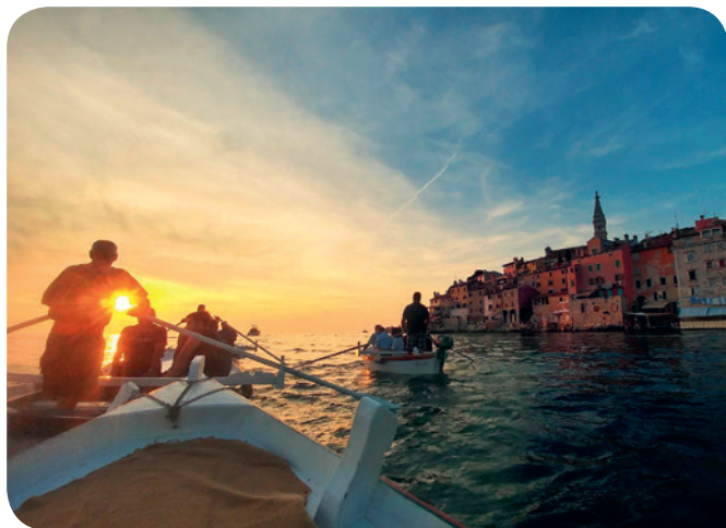
Batana boat parade

the typical Rovinj tavern, and since then, it has been a venue for wine and food tastings and musical evenings. This is the place which perfectly pairs Malvazija, Teran, olive oil, fish and seafood with the typical and distinctive melodies of Rovinj.