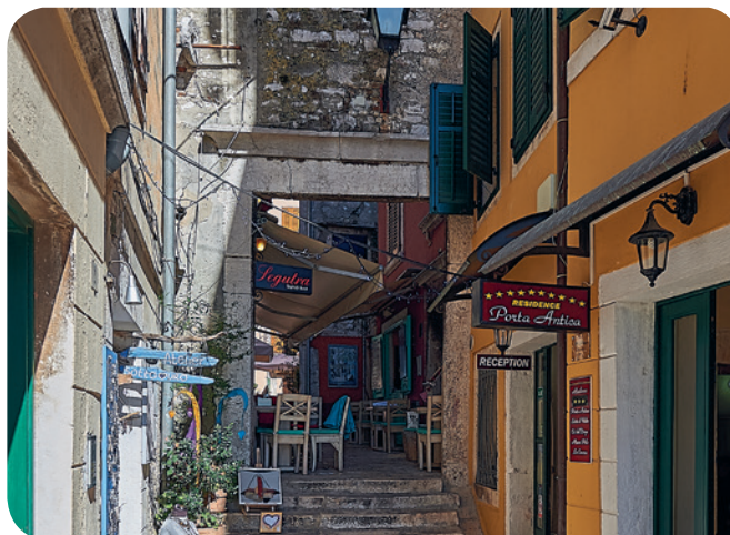
Town Gate under the Walls

During summer, the small square in front of the House of Batana becomes a place where intangible cultural heritage is celebrated, i.e. where the batàna boat is built and repaired as a cultural and touristic attraction. The experience is further enriched by cultural programmes during which, each Wednesday and Sunday, in addition to the construction or repair of the batàna boat, visitors are offered concerts of traditional Rovinj music and local culinary specialties. Traditional launching of newly built and repaired batàna boats from the shore (the Little Pier) is especially attractive. The art of batàna building has been entered into the Registry of Intangible Cultural Heritage of the Republic of Croatia.