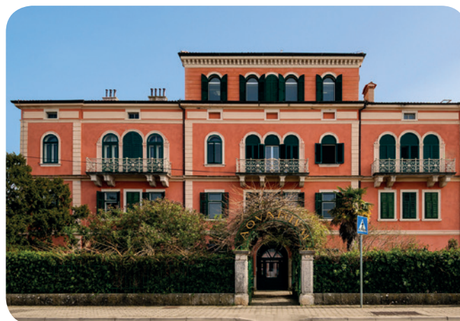
Centre for Marine Research of the Ruđer Bošković Institute

The scientific library of the Centre is located in the former medieval St. Gotard's Church.