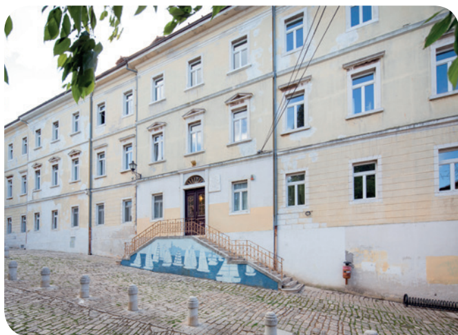
Vladimir Nazor Elementary School