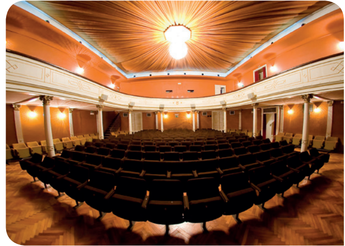
"Antonio Gandusio" Theater