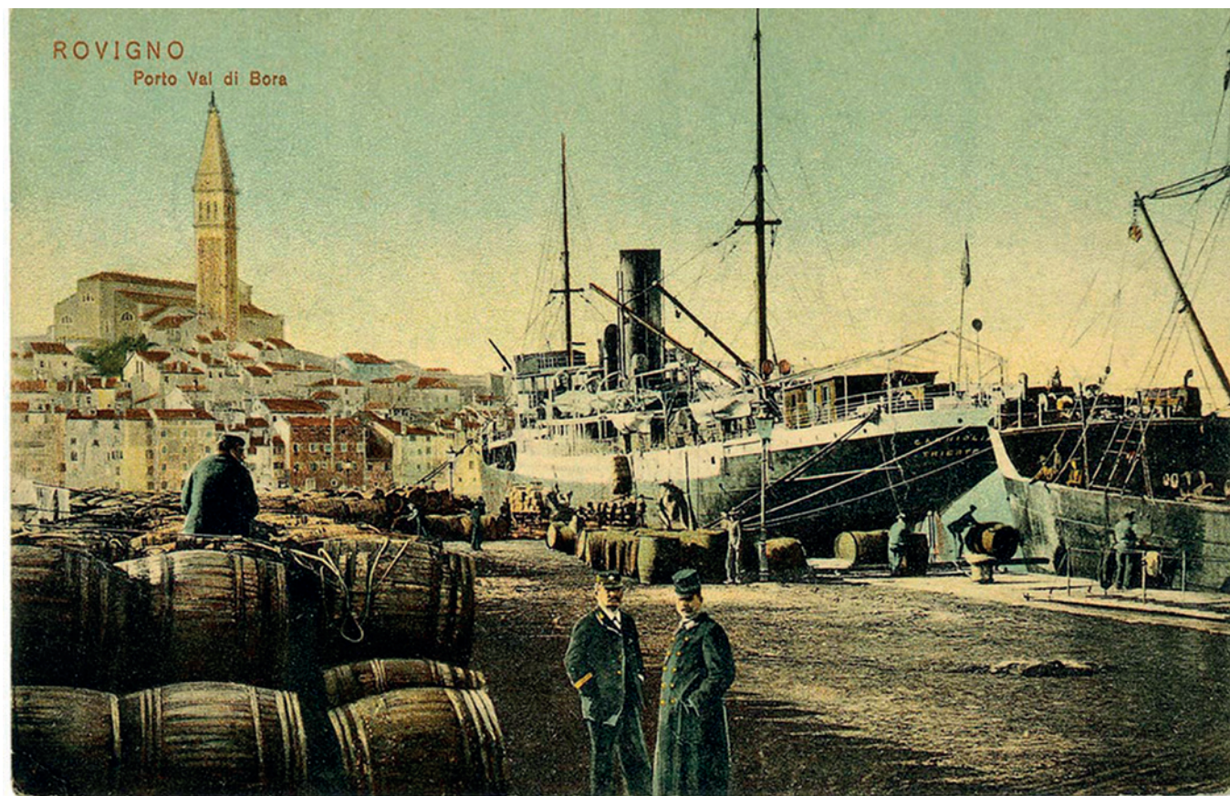
Valdibora harbour in the past