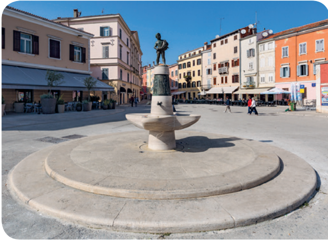
Marshal Tito Square